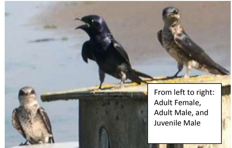
From left to right: Adult Female, Adult Male, and Juvenile Male