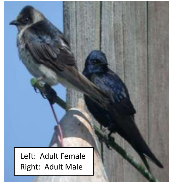
Left: Adult Female Right: Adult Male